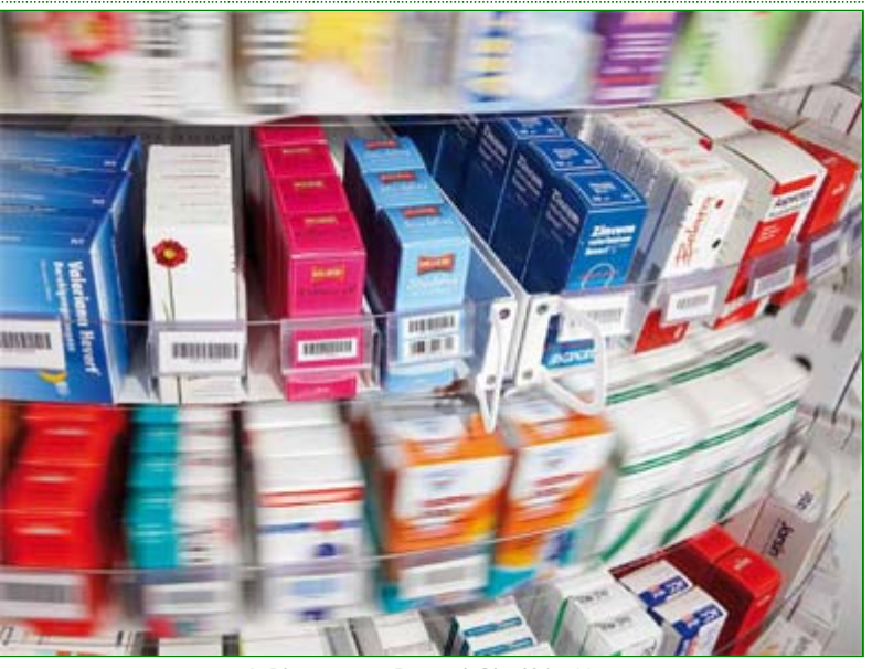
A Pharmacy Round Shelf in Use