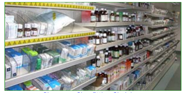
Pharmacy Shopfitting Shelving