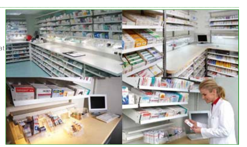
Z Series Pharmacy Work Station

Exeter, EX4 4RN Email sales@pharmacy-shelving.co.uk