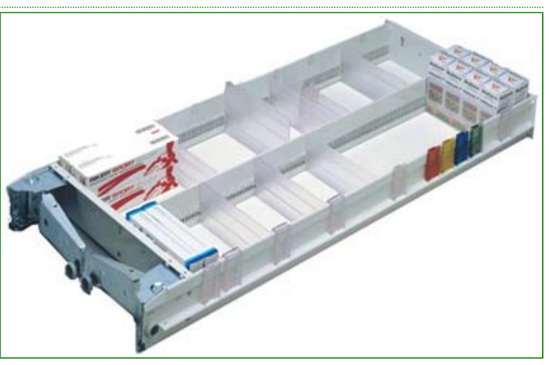
FZ Pharmacy Drawer with Solid Bottom