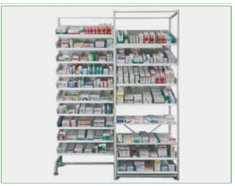
PZ Fast-Mover Pharmacy Pullout Shelving

The Innovation Centre University of Exeter, Rennes Drive Exeter, EX4 4RN Tel 0113 350 8696 Fax 0115 727 0123 Email sales@pharmacy-shelving.co.uk