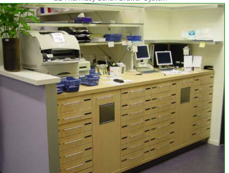
BZ Bench Drawers width Customised Drawer Fronts