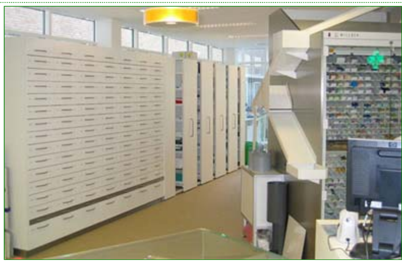
Z Series Pharmacy Storage Solutions

For quick access to a wide range of pharmaceuticals.