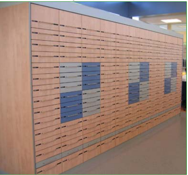
Z Series Full Height Pharmacy Drawers