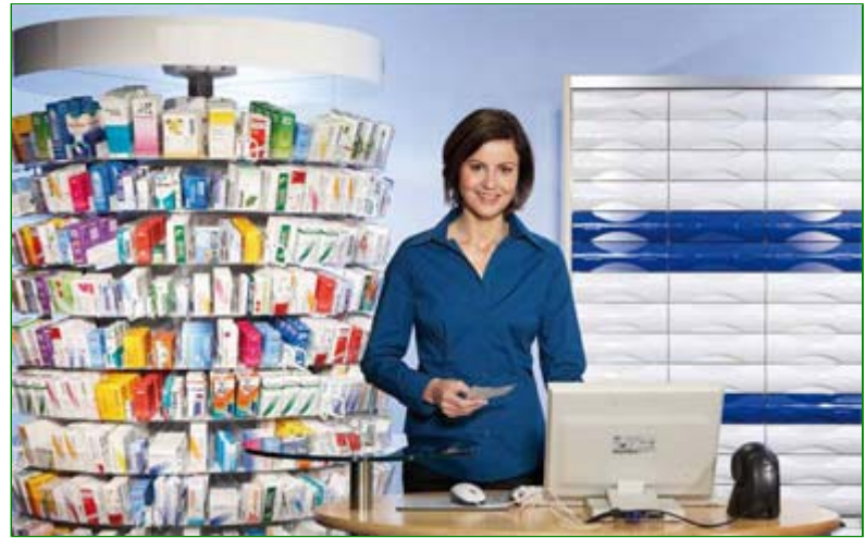
RZ Pharmacy Round Shelf Combined with Drawers