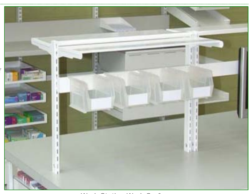
Work Station Work Surface