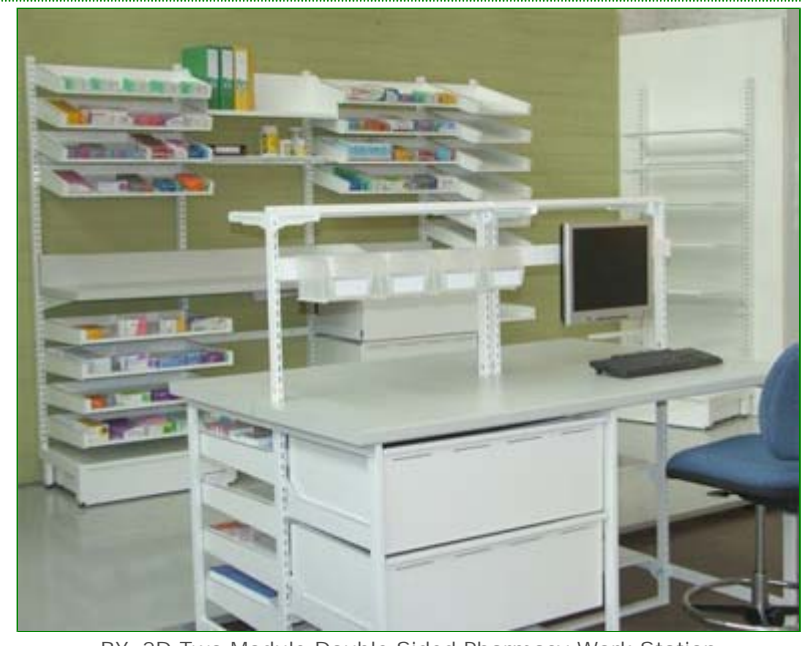
BY_2D Two Module Double Sided Pharmacy Work Station