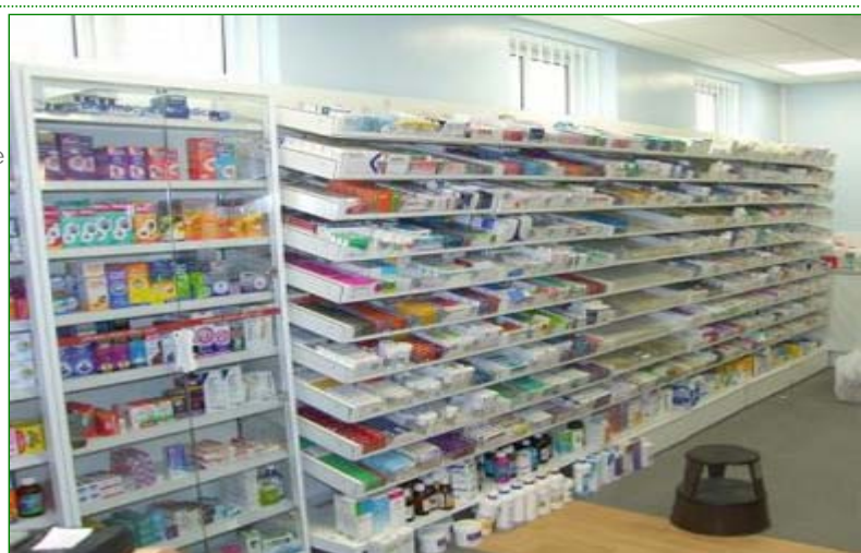
Pharma Drawer Full Height Shelving - Ten Shelves Per Bay