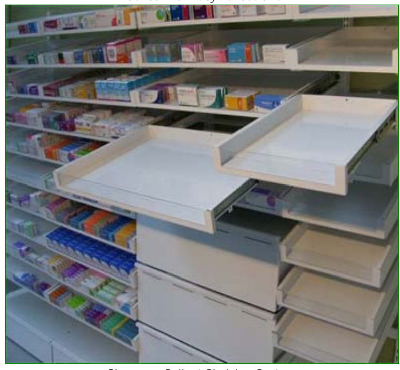
Pharmacy Pullout Shelving System