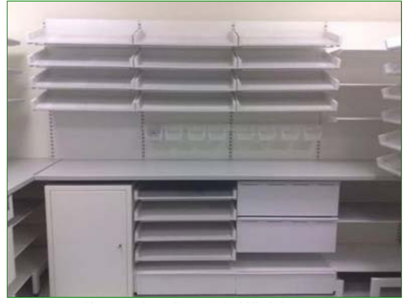
Pharmacy Deep Drawers And Plinth Drawers