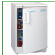
Labcold RLPR05042A Sparkfree Laboratory Fridge 160 Litres

Capacity: 151 Litre Config: Under Bench 845mm H x 595mm W x 595mm D Product Code: FPD-09796