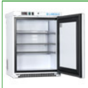
Labcold RAFR05202 Advanced Laboratory Freezer 150 Litres

Advanced freezers are completely constructed from powder coated mild steel with a stainless steel interior so are built to last. Insulated with Envirofoam and fitted with micro processor controllers these freezers provide accurate temperature control with low GWP. All Advanced freezers have optimised air circulation for superior temperature control and feature a temperature display, high and low temperature alarms and door locks fitted as standard. For ease of positioning the larger cabinets have heavy duty wheels with a brake. Designed for any situation where accurate temperature control is vital and there is a need to store a large quantity of product. Advanced freezers can be fitted with access ports and remote alarm contacts.