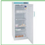
LEC PSR273UK - Pharmacy Fridge 273 Litre with Solid Door

All pharmacy fridges are developed with reliability and ease of use in mind. Our pharmacy refrigeration range conforms to the guidelines set out by the RPSGB and maintains an internal temperature of between +2°C and +8°C. We have added a number of improvements to certain popular models to ensure we are offering you the best possible secure and reliable refrigerated storage. Many of our fridges are available with different plug options for Europe and Australasia, or with compressors operating at 60Hz.