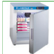
Labcold IntelliCold™ RLDF0110 - 36 Litre Pharmacy Fridge with Solid Door