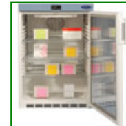
Shoreline SM161G - 141 Litres Pharmacy Fridge with Glass Door

Capacity: 107 Litre Config: Under Bench 830mm H x 495mm W x 620mm D Product Code: FPD-09745