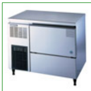
Hoshizaki Freestanding Flake/Nugget Ice Machine (125kg/24h)

Capacity: 125 kg/24h Config: Free Standing 800mm H x 940mm W x 600mm D