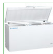
Labcold RLCF2120 Sparkfree Laboratory Freezer 607 Litres

Capacity: 447 Litre Config: Chest Freezer 860mm H x 1300mm W x 730mm D Product Code: FPD-04935