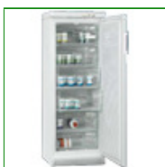
Labcold RLVF07203 - 180 Litre Sparkfree Laboratory Freezer with Solid Door

The Labcold Sparkfree range is engineered to store flammable materials safely with no sources of ignition inside the chambers. Everything that could conceivably cause a spark, such as the controller, is located outside of the freezer chamber making these freezers an important part of laboratory safety. Designed specifically for laboratories, these freezers are solidly built and come in both upright and chest configuration. All Labcold Sparkfree freezers and chest freezers are factory fitted with a door lock for optimum security.