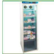
Labcold IntelliCold™ RLDG1510 - 430 Litre Pharmacy Fridge with Glass Door