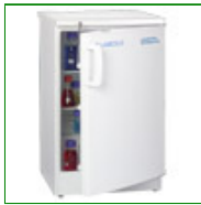
Labcold RLPF05042A Fan Air Circulated Laboratory Fridge 160 Litres

Fan circulated refrigerators are designed for temperature uniformity throughout the chamber of the refrigerator. Where not integral, all fan circulated fridges can be factory fitted with high/ low temperature alarms and digital temperature displays. Available in a range of sizes, all models feature a door lock for extra security and adjustable shelves so you can make the most of the space available.