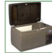
Shoreline SMP41 - 41 Litres Portable Medical Fridge