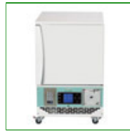
Blood Bank 48 Pack with Solid Door

Capacity: 78 Packs 780mm H x 522mm W x 600mm D Product Code: FPD-09661