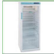
LEC PGR273UK - Pharmacy Fridge 273 Litre with Glass Door

Capacity: 273 Litre Config: Free Standing 1565mm H x 595mm W x 670mm D Product Code: FPD-09747