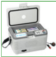
Labcold RPDF0012D Portable Medical Fridge

A selection of products designed for transportation of Vaccines and Specimen Collection. The portable refrigerator comes with an in-car power cable to keep its contents at the desired temperature whilst in transit. The Thermal Transportation bags allow for transportation of its contents over short trips approx 3 hours And the premium Vaccine carriers can hold the temperature for up to Eight hours allowing for longer transit times.