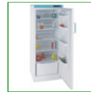
LEC LSR288 Laboratory Refrigerator 288L Litre

Capacity: 160 Litre Config: Upright Refrigerator 850mm H x 550mm W x 600mm D Product Code: FPD-07537