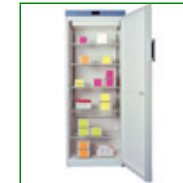
Shoreline SM360 - 360 Litres Pharmacy Fridge with Solid Door

Capacity: 360 Litre Config: Free Standing 1595mm H x 600mm W x 600mm D Product Code: FPD-04356