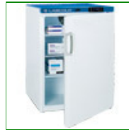
Labcold IntelliCold™ RLDF0510 - 150 Litre Pharmacy Fridge with Solid Door