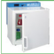
Labcold RLBF1740 Superfreezer 50 Litres

For laboratory and general use where storage at below normal freezing temperatures down to -40°C and/or where there is a concern that volatile, flammable materials or components might be stored now, or at some point in the future.