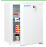
Labcold RLPR02042 Sparkfree Laboratory Fridge 60 Litres

The Sparkfree Fridges is engineered to store flammable materials safely with no sources of ignition inside the chambers. Everything that could conceivably cause a spark, such as the controller, is located outside of the refrigerator chamber making these fridges and freezers an important part of laboratory safety. Designed specifically for laboratories, these refrigerators are solidly built and come in a range of sizes, from a compact bench top to a large 400 litre refrigerator. All Sparkfree fridges are factory fitted with a door lock for optimum security.