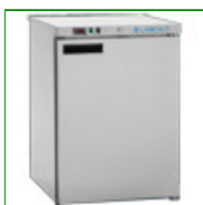
Labcold RFR05043 Advanced Laboratory Fridge 150 Litres with Solid Door

Advanced fridges are completely constructed from powder coated mild steel with a stainless steel interior so are built to last. Insulated with Envirofoam® and fitted with micro processor controllers these fridges provide accurate temperature control with low GWP. All Advanced refrigerators have optimised air circulation for superior temperature control and feature a temperature display, high and low temperature alarms and door locks fitted as standard. For ease of positioning the larger cabinets have heavy duty wheels with a brake. The Advanced range of refrigerators can be fitted with access ports and remote alarm contacts if required