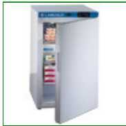
Labcold IntelliCold™ RLDF0210 - 66 Litre Pharmacy Fridge with Solid Door

All pharmacy fridges are developed with reliability and ease of use in mind. Our pharmacy refrigeration range conforms to the guidelines set out by the RPSGB and maintains an internal temperature of between +2°C and +8°C. We have added a number of improvements to certain popular models to ensure we are offering you the best possible secure and reliable refrigerated storage. Many of our fridges are available with different plug options for Europe and Australasia, or with compressors operating at 60Hz.