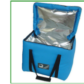
20 Litre Thermal Carry Bag with 2 Separators