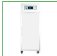
Blood Bank 432 Pack with Solid Door

Capacity: 439 Packs 1980mm H x 680mm W x 850mm D Product Code: FPD-09669