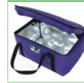
10 Litre Thermal Carry Bag with 1 Separator