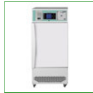
Blood Bank 72 Pack with Solid Door

Capacity: 110 Packs 1200mm H x 520mm W x 605mm D Product Code: FPD-09665