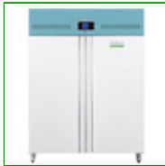
LEC PSR1200UK - Pharmacy Fridge 1200 Litre with Solid Door

All pharmacy fridges are developed with reliability and ease of use in mind. Our pharmacy refrigeration range conforms to the guidelines set out by the RPSGB and maintains an internal temperature of between +2°C and +8°C. We have added a number of improvements to certain popular models to ensure we are offering you the best possible secure and reliable refrigerated storage. Many of our fridges are available with different plug options for Europe and Australasia, or with compressors operating at 60Hz.