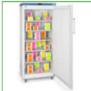
Shoreline SM541 - 544 Litres Pharmacy Fridge with Solid Door