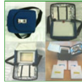
Three Inch Vaccine Thermal Carrier