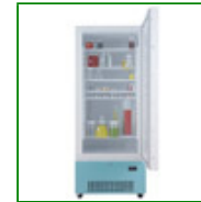
LEC LR1607C Laboratory Refrigerator 474 Litre

Capacity: 400 Litre Config: Upright Refrigerator 1860mm H x 600mm W x 695mm D Product Code: FPD-07707