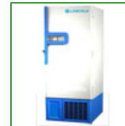
Labcold LULT2080 DuoCold Ultra Low Temperature Freezer 538 Litre

Capacity: 538 Litre Config: Chest 2020mm H x 840mm W x 985mm D