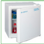
Labcold RLVF02203 Sparkfree Laboratory Freezer 36 Litres

The Labcold Sparkfree range is engineered to store flammable materials safely with no sources of ignition inside the chambers. Everything that could conceivably cause a spark, such as the controller, is located outside of the freezer chamber making these freezers an important part of laboratory safety. Designed specifically for laboratories, these freezers are solidly built and come in both upright and chest configuration. All Labcold Sparkfree freezers and chest freezers are factory fitted with a door lock for optimum security.