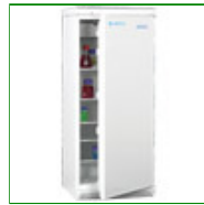
Labcold RLPF09043A Fan Air Circulated Laboratory Fridge 285 Litres

Capacity: 285 Litre Config: Free Standing 1435mm H x 600mm W x 625mm D