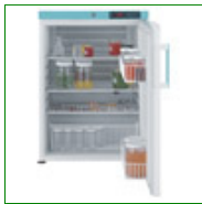
LEC LSR151 Laboratory Refrigerator 151 Litre

Capacity: 141 Litre Config: Bench Top 820mm H x 600mm W x 615mm D Product Code: FPD-10260