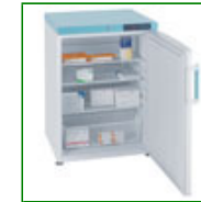
LEC PSR151UK - Pharmacy Fridge 151 Litre with Solid Door