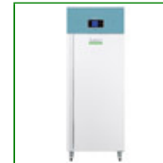
LEC PSR600UK - Pharmacy Fridge 600 Litre with Solid Door