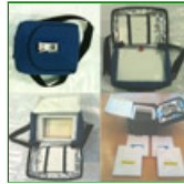
Two Inch Vaccine Thermal Carrier

The 3 Inch and 2 inch thermal vaccine carriers have been designed to maintain a temperature of between a 2° to 8°C for up to 8 hours, especially for use with vaccination programmes or specimen collection. The inner lid reduces thermal leakage helping to maintain temperature parameters despite repeated opening of the bag. Developed using NASA technology Polartherm™ is made up of an inner reflective layer, a hollow fibre filler and a waterproof woven PVC outer, the result of which is a material that is both tough and lightweight with excellent thermal control properties.