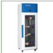
RLCG0600 Labcold Refrigerated Cooled Incubator - Glass Door

Capacity: 600 Packs Config: Free Standing 1980mm H x 720mm W x 820mm D