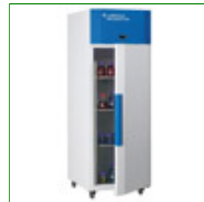
RLSD0600 Labcold Refrigerated Cooled Incubator - Solid Door

Capacity: 600 Packs Config: Free Standing 1980mm H x 720mm W x 820mm D