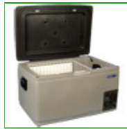
Shoreline SMP65 - 65 Litres Portable Medical Fridge