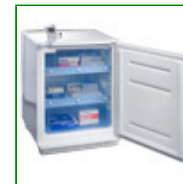
53 Litre Silenco Lockable Pharmacy Absorption Fridge