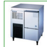
Hoshizaki Freestanding Flake/Nugget Ice Machine (125kg/24h)

Capacity: 125 kg/24h Config: Free Standing 800mm H x 640mm W x 600mm D