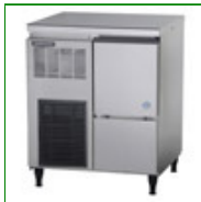
Hoshizaki Freestanding Flake/Nugget Ice Machine (85kg/24h)

Compact ice/water dispenser - Perfect for use in busy areas where people need access to an ongoing fresh water and ice supply, such as a hospital ward. Hygienic ice production - Ice moves straight to an airtight storage hopper as soon as it is produced, so it has no contact with light or air until it is dispensed, keeping its hygienic integrity.