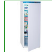
Labcold IntelliCold™ RLDG1010 - 300 Litre Pharmacy Fridge with Solid Door

Capacity: 273 Litre Config: Free Standing 1565mm H x 595mm W x 660mm D Product Code: FPD-09756