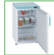
LEC LR307C Laboratory Refrigerator 107 Litre

Capacity: 82 Litre Config: Bench Top 660mm H x 502mm W x 540mm D Product Code: FPD-09794