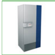
LEC ULT342 Low Temperature 322 Litre Upright Super Freezer

Capacity: 113 Litre Config: Chest 1080mm H x 730mm W x 850mm D Product Code: FPD-10220