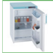
LEC LSC119UK Laboratory Fridge Freezer

Capacity: 83 Litre Config: Bench Top 660mm H x 502mm W x 540mm D Product Code: FPD-09808