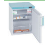
LEC PE207C - Pharmacy Fridge 82 Litre with Solid Door

Capacity: 75 Litre Config: Bench Top 790mm H x 450mm W x 430mm D Product Code: FPD-07731