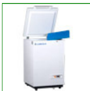
Labcold ULTF80 Compact Ultra Low Temperature Freezer 74 Litre

Labcold Compact ULT freezers utilize a Japanese adaptation of a refrigeration technique tried and tested for many years in freezers operating at temperatures as low as -150°C. Using a single, commonly available, European compressor and fewer moving parts than more conventional ULT freezers these products will provide reliable storage at temperatures down to -83°C. This new and unique range is set to revolutionize the use of ultra low temperature freezers, particularly when -80°C storage is needed close to the work place.