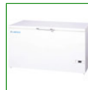
Labcold ULTF420 Compact Ultra Low Temperature Freezer 383 Litre

Capacity: 276 Litre Config: Chest 885mm H x 1260mm W x 695mm D Product Code: FPD-04991