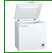
Labcold RLHE0845 Superfreezer 237 Litres

Capacity: 237 Litre Config: Chest 860mm H x 1050mm W x 735mm D