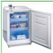
28 Litre Silenco Lockable Pharmacy Absorption Fridge

All pharmacy fridges are developed with reliability and ease of use in mind. Our pharmacy refrigeration range conforms to the guidelines set out by the RPSGB and maintains an internal temperature of between +2°C and +8°C. We have added a number of improvements to certain popular models to ensure we are offering you the best possible secure and reliable refrigerated storage. Many of our fridges are available with different plug options for Europe and Australasia, or with compressors operating at 60Hz.