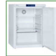
Liebherr LKUexv 1610 Laboratory Refrigerator - 141 Litre

Capacity: 107 Litre Config: Under Bench 830mm H x 495mm W x 620mm D Product Code: FPD-09795