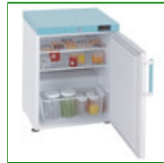
LEC LR207C Laboratory Refrigerator 82 Litre

Capacity: 60 Litre Config: Upright Refrigerator 572mm H x 485mm W x 520mm D Product Code: FPD-04912