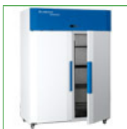
Labcold RFR44042 Advanced Laboratory Fridge 1245 Litres