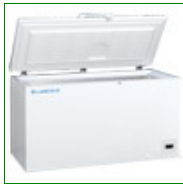
Labcold RLHE1345 Superfreezer 375 Litres

Capacity: 375 Litre Config: Chest 860mm H x 1500mm W x 735mm D