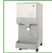
Hoshizaki Countertop Ice/Water Dispenser (125kg/24h)

Capacity: 152 kg/24h Config: Free Standing 855mm H x 350mm W x 585mm D