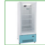
LEC PG1607C - Pharmacy Fridge 444 Litre with Glass Door