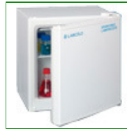
Labcold RLVF02203/LK Sparkfree Laboratory Freezer 36 Litres Lockable

Capacity: 36 Litre Config: Upright Freezer 515mm H x 440mm W x 500mm D Product Code: FPD-09917