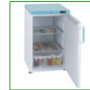
LEC ISU37C Laboratory Freezer 102 Litres

Capacity: 50 Litre Config: Bench Top 562mm H x 500mm W x 510mm D Product Code: FPD-09804