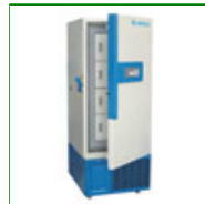
Labcold LULT1480 DuoCold Ultra Low Temperature Freezer 388 Litre

Capacity: 388 Litre Config: Chest 2020mm H x 840mm W x 985mm D