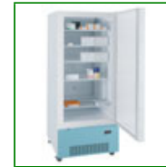
LEC PE1607C - Pharmacy Fridge 444 Litre with Solid Door