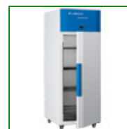
Labcold RFR21042 Advanced Laboratory Fridge 577 Litres