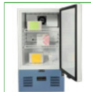
Shoreline SM45 - 45 Litres Pharmacy Fridge with Solid Door