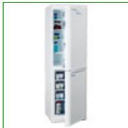
Labcold RLFF13246 Laboratory Fridge/Freezer 230/160 Litres

Capacity: 324 Litre Config: Upright Refrigerator 1870mm H x 600mm W x 600mm D Product Code: FPD-09811