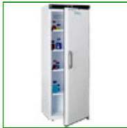
Labcold RLHD13043 Sparkfree Laboratory Fridge 360 Litres

The Sparkfree Fridges is engineered to store flammable materials safely with no sources of ignition inside the chambers. Everything that could conceivably cause a spark, such as the controller, is located outside of the refrigerator chamber making these fridges and freezers an important part of laboratory safety. Designed specifically for laboratories, these refrigerators are solidly built and come in a range of sizes, from a compact bench top to a large 400 litre refrigerator. All Sparkfree fridges are factory fitted with a door lock for optimum security.