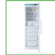
LEC LSC324UK Laboratory Fridge Freezer

Capacity: 263 Litre Config: Upright Refrigerator 1680mm H x 540mm W x 600mm D Product Code: FPD-09810