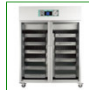
Blood Bank 864 Pack with Glass Door

Capacity: 439 Packs 1980mm H x 680mm W x 850mm D Product Code: FPD-09670