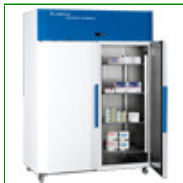
Labcold RPF44042 - 1245 Litre Advanced Pharmacy Fridge with Solid Door