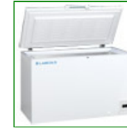
Labcold RLHE1145 Superfreezer 314 Litres

Capacity: 314 Litre Config: Chest 860mm H x 1305mm W x 735mm D