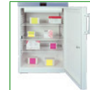
Shoreline SM161 - 141 Litres Pharmacy Fridge with Solid Door

Capacity: 141 Litre Config: Under Bench 835mm H x 600mm W x 615mm D Product Code: FPD-08130