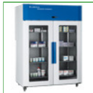
Labcold RPF44042 - 1245 Litre Advanced Pharmacy Fridge with Glass Door