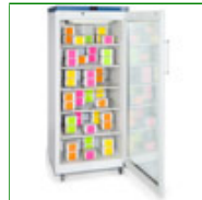
Shoreline SM541G - 544 Litres Pharmacy Fridge with Glass Door