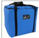
30 Litre Thermal Carry Bag with 3 Separators