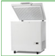
LEC CLT140 Low Temperature 140 Litre Chest Freezer

A variety of specialist Low Temperature Chest Freezers Minus 10°C to Minus 45°C for the storage of chemicals, samples and other important matter.