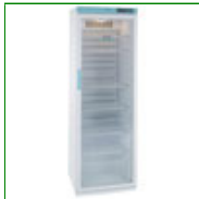
LEC PGR334UK - Pharmacy Fridge 334 Litre with Glass Door

Capacity: 300 Litre Config: Free Standing 1500mm H x 600mm W x 600mm D Product Code: FPD-09840