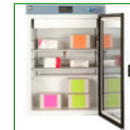
Shoreline SM60G - 60 Litres Pharmacy Fridge with Glass Door