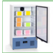
Shoreline SM75 - 75 Litres Pharmacy Fridge with Solid Door

Capacity: 66 Litre Config: Bench Top/Wall Mounted 725mm H x 450mm W x 485mm D Product Code: FPD-09836