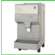
Hoshizaki Countertop Ice/Water Dispenser (60kg/24h)

Compact ice/water dispenser - Perfect for use in busy areas where people need access to an ongoing fresh water and ice supply, such as a hospital ward. Hygienic ice production - Ice moves straight to an airtight storage hopper as soon as it is produced, so it has no contact with light or air until it is dispensed, keeping its hygienic integrity.