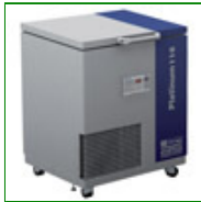
LEC CLT112 Low Temperature 113 Litre Chest Super Freezer

A variety of specialist Ultra Low Temperature Freezers Minus 40°C to Minus -85°C for the storage of chemicals, samples and other important matter.