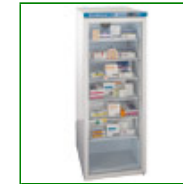
Labcold IntelliCold™ RLDG1010 - 300 Litre Pharmacy Fridge with Glass Door

Capacity: 300 Litre Config: Free Standing 1500mm H x 600mm W x 660mm D Product Code: FPD-09839