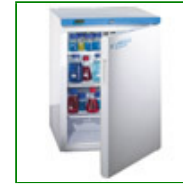
RLSD01502 Labcold Cooled Incubator with Solid Door

Capacity: 150 Packs Config: Under Bench 820mm H x 600mm W x 600mm D