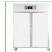
Blood Bank 864 Pack with Solid Door

Capacity: 960 Packs 1980mm H x 1340mm W x 850mm D Product Code: FPD-09671