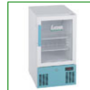
LEC PG102C - Pharmacy Fridge 41 Litre with Glass Door