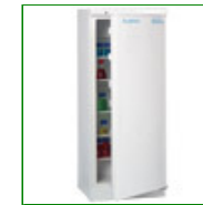
Labcold RLPR09043A Sparkfree Laboratory Fridge 285 Litres

Capacity: 284 Litre Config: Free Standing 1570mm H x 595mm W x 634mm D Product Code: FPD-09797