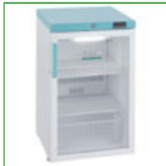
LEC PG307C - Pharmacy Fridge 107 Litre with Glass Door

Capacity: 82 Litre Config: Bench Top 660mm H x 502mm W x 450mm D Product Code: FPD-09753