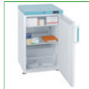
LEC PE307C - Pharmacy Fridge 107 Litre with Solid Door

Capacity: 107 Litre Config: Under Bench 830mm H x 495mm W x 620mm D Product Code: FPD-09754