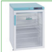
LEC PGR151UK - Pharmacy Fridge 151 Litre with Glass Door