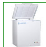
Labcold RLCF0720 Sparkfree Laboratory Freezer 215 Litres

Capacity: 180 Litre Config: Upright Freezer 1440mm H x 544mm W x 570mm D Product Code: FPD-07709