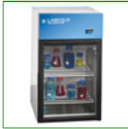
RLCG0100 Labcold Cooled Incubator with Glass Door

Cooled incubators are ideal for microbiology or any application where precise and consistent temperatures at or below room temperature are demanded. Available in a range of sizes from a small benchtop model through to a large 600 litre unit constructed from mild steel with stainless steel interior, these new cooled incubators from Labcold all feature fan air circulation for even temperature distribution and microprocessor controlled temperature regulation for improved accuracy and stability.