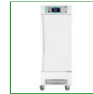
Blood Bank 360 Pack with Solid Door

Capacity: 350 Packs 1935mm H x 680mm W x 865mm D Product Code: FPD-09667