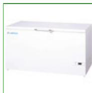
Labcold ULTF320 Compact Ultra Low Temperature Freezer 276 Litre

Capacity: 74 Litre Config: Chest 875mm H x 550mm W x 645mm D Product Code: FPD-04990