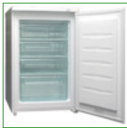
Labcold RLVF04202A Sparkfree Laboratory Freezer 120 Litres

Capacity: 102 Litre Config: Under Bench 830mm H x 495mm W x 620mm D Product Code: FPD-09805