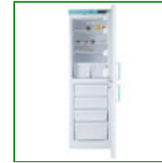
LEC LSC263UK Laboratory Fridge Freezer

Capacity: 119 Litre Config: Under Bench 860mm H x 540mm W x 600mm D Product Code: FPD-09809