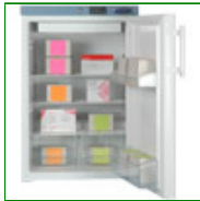
Shoreline SM150 - 150 Litres Pharmacy Fridge with Solid Door

All pharmacy fridges are developed with reliability and ease of use in mind. Our pharmacy refrigeration range conforms to the guidelines set out by the RPSGB and maintains an internal temperature of between +2°C and +8°C. We have added a number of improvements to certain popular models to ensure we are offering you the best possible secure and reliable refrigerated storage. Many of our fridges are available with different plug options for Europe and Australasia, or with compressors operating at 60Hz.