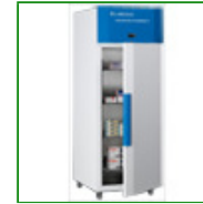
Labcold RPF21042 - 571 Litre Advanced Pharmacy Fridge with Solid Door