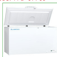
Labcold RLCF1520 Sparkfree Laboratory Freezer 447 Litres

Capacity: 375 Litre Config: Upright Freezer 1850mm H x 595mm W x 640mm D Product Code: FPD-04933