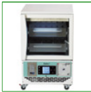
Blood Bank 48 Pack with Glass Door

Lec Medical bloodbanks have been designed in conjunction with bloodbank centres and we are proud of the many features they provide. Each bloodbank is built to order in the UK and can be delivered directly to your haematology department. All bloodbanks come with a 48 hour battery back-up for the controller, an energy efficient LED light and auto defrost as standard.