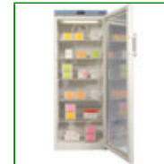
Shoreline SM360G - 360 Litres Pharmacy Fridge with Glass Door

Capacity: 334 Litre Config: Free Standing 1860mm H x 595mm W x 670mm D Product Code: FPD-09748