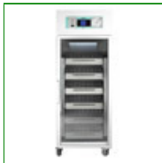
Blood Bank 432 Pack with Glass Door

Lec Medical bloodbanks have been designed in conjunction with bloodbank centres and we are proud of the many features they provide. Each bloodbank is built to order in the UK and can be delivered directly to your haematology department. All bloodbanks come with a 48 hour battery back-up for the controller, an energy efficient LED light and auto defrost as standard.