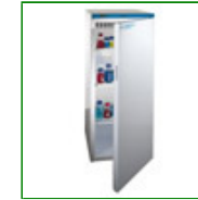
RLSD0300 Labcold Refrigerated Cooled Incubator - Solid Door

Capacity: 300 Packs Config: Free Standing 1487mm H x 600mm W x 650mm D