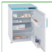
LEC WSR151UK Ward Refrigerator 151 Litre

Capacity: 82 Litre Config: Bench Top 660mm H x 502mm W x 540mm D Product Code: FPD-09812