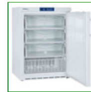
Liebherr LGUex 1500 Laboratory Freezer - 139 Litre

Capacity: 120 Litre Config: Upright Freezer 850mm H x 545mm W x 565mm D Product Code: FPD-07540