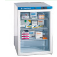
Labcold IntelliCold™ RLDG0510 - 150 Litre Pharmacy Fridge with Glass Door