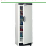
Labcold RLVF14201 Sparkfree Laboratory Freezer 375 Litres

Capacity: 232 Litre Config: Free Standing 1570mm H x 595mm W x 634mm D Product Code: FPD-09807