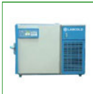
Labcold LULT0480 DuoCold Ultra Low Temperature Freezer 100 Litre

Designed to store materials safely at low temperatures, this NEW Labcold freezer features two compressors and is backed by a 5 year warranty comprising of three years parts and labour with maintenance visits with the option for a further 2 years parts only warranty, making this freezer a cost effective purchase. Featuring VIP technology, this freezer is designed to provide a large amount of storage whilst occupying as little laboratory space as possible.