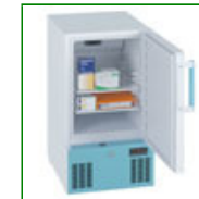
LEC PE102C - Pharmacy Fridge 41 Litre with Solid Door