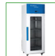
Labcold RFG21042 Advanced Laboratory Fridge 577 Litres