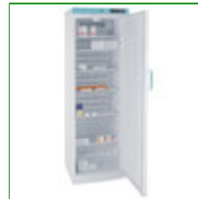
LEC PSR334UK - Pharmacy Fridge 334 Litre with Solid Door

Capacity: 334 Litre Config: Free Standing 1860mm H x 595mm W x 660mm D Product Code: FPD-09757