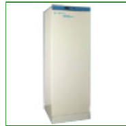
Labcold RLSP1505 - 400 Litre Sparkfree Laboratory Fridge with Solid Door

Capacity: 360 Litre Config: Upright Refrigerator 1750mm H x 585mm W x 655mm D Product Code: FPD-04917