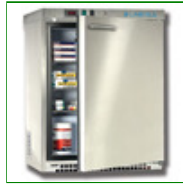
Labcold RPF05043 - 150 Litre Advanced Pharmacy Fridge with Glass Door