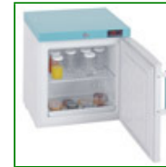
LEC ISU27C Laboratory Freezer 50 Litres

Capacity: 36 Litre Config: Upright Freezer 515mm H x 440mm W x 500mm D Product Code: FPD-09918