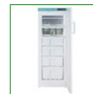
LEC LSF232UK Laboratory Freezer 232 Litres

Capacity: 215 Litre Config: Chest Freezer 860mm H x 720mm W x 730mm D Product Code: FPD-04934