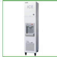
Hoshizaki Freestanding Ice/Water Dispenser (32kg/24h)

Capacity: 32 kg/24h Config: Free Standing 1600mm H x 350mm W x 500mm D