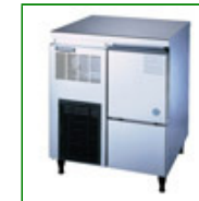
Hoshizaki Freestanding Flake/Nugget Ice Machine (110kg/24h)

Capacity: 110 kg/24h Config: Free Standing 800mm H x 640mm W x 600mm D