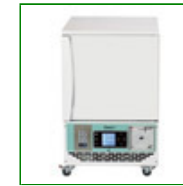
Blood Bank 48 Pack with Solid Door

Capacity: 78 Packs 830mm H x 520mm W x 600mm D Product Code: FPD-09663