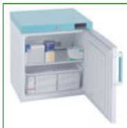
LEC PE109C - Pharmacy Fridge 45 Litre with Solid Door