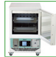
Blood Bank 48 Pack with Glass Door

Capacity: 78 Packs 780mm H x 522mm W x 600mm D Product Code: FPD-09662