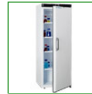
Labcold RLHF13043 Fan Air Circulated Laboratory Fridge 390 Litres

Capacity: 390 Litre Config: Free Standing 1880mm H x 580mm W x 615mm D