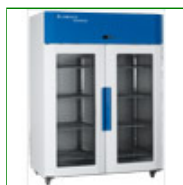
Labcold RFG44042 Advanced Laboratory Fridge 1245 Litres