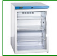
RLCG01502 Labcold Cooled Incubator with Glass Door

Capacity: 150 Packs Config: Under Bench 820mm H x 600mm W x 600mm D