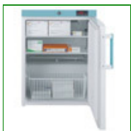
LEC WR207C Ward Refrigerator 82 Litre

This range provide the secure storage of foodstuffs within the ward environment. The newly improved range operate at +3°C with an available operating range of +1° to +5°C, all refrigerators come with lockable doors, external temperature controller and have a two year warranty .