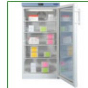
Shoreline SM260G - 260 Litres Pharmacy Fridge with Glass Door