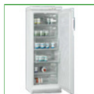
Labcold RLVF07203LK - 180 Litre Sparkfree Laboratory Freezer with Solid Door

Capacity: 180 Litre Config: Upright Freezer 1440mm H x 544mm W x 570mm D Product Code: FPD-07708