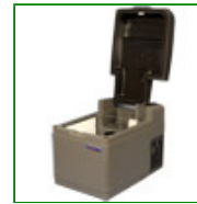
Shoreline SMP26 - 26 Litres Portable Medical Fridge