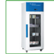
Labcold RPF21042 - 571 Litre Advanced Pharmacy Fridge with Glass Door