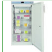
Shoreline SM260 - 260 Litres Pharmacy Fridge with Solid Door