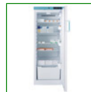
LEC WSR288UK Ward Refrigerator 288 Litre

Capacity: 151 Litre Config: Under Bench 845mm H x 595mm W x 635mm D Product Code: FPD-09813