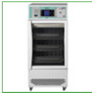
Blood Bank 72 Pack with Glass Door

Capacity: 78 Packs 830mm H x 520mm W x 600mm D Product Code: FPD-09664