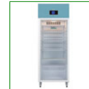
LEC PGR600UK - Pharmacy Fridge 600 Litre with Glass Door