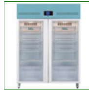
LEC PGR1200UK - Pharmacy Fridge 1200 Litre with Glass Door

Capacity: 1200 Litre Config: Free Standing 1995mm H x 1330mm W x 840mm D Product Code: FPD-10200