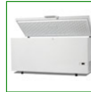
LEC CLT383 Low Temperature 383 Litre Chest Freezer

Capacity: 383 Litre Config: Chest 885mm H x 1560mm W x 600mm D