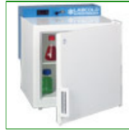
Labcold RLBF1740/LK Superfreezer 50 Litres

Capacity: 50 Litre Config: Bench Top 580mm H x 550mm W x 620mm D