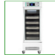
Blood Bank 360 Pack with Glass Door

Capacity: 110 Packs 1200mm H x 520mm W x 605mm D Product Code: FPD-09666