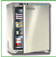
Labcold RPF05043 - 150 Litre Advanced Pharmacy Fridge with Solid Door

The Labcold Advanced Pharmacy range of refrigerators represents the highest levels of performance, constructional quality, robustness, and appearance available in the market place. Heavy-duty all-metal construction provides strength and durability with ease of cleaning or sanitisation. Microprocessor control, together with ducted airflow and advanced auto defrost system provide class leading temperature stability and uniformity.