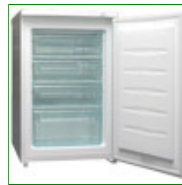
Labcold RLVF04202A/LK Sparkfree Laboratory Freezer 120 Litres

Capacity: 120 Litre Config: Upright Freezer 850mm H x 545mm W x 565mm D Product Code: FPD-07539