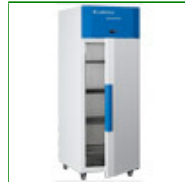
Labcold RAFR21262 Advanced Laboratory Freezer 571 Litres

Capacity: 150 Litre Config: Upright Freezer 830mm H x 600mm W x 620mm D Product Code: FPD-04946