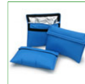
A4 Thermal Vaccine Wallet