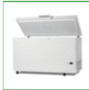
LEC CLT296 Low Temperature 296 Litre Chest Freezer

Capacity: 296 Litre Config: Chest 885mm H x 1260mm W x 600mm D