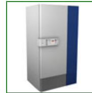
LEC ULT532 Low Temperature 500 Litre Upright Super Freezer

Capacity: 322 Litre Config: Free Standing 1985mm H x 765mm W x 900mm D Product Code: FPD-10221