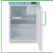
LEC ISR27C Laboratory Fridge Freezer

This is the latest generation of combined sparkfree laboratory refrigerator and freezer. Providing all the routine storage required on a floor area no bigger than a standard fridge. For laboratory and general use where there is a concern that volatile, flammable materials or components might be stored now, or at some point in the future. Both refrigerated and frozen samples can be stored and accessed within the same small floor area.