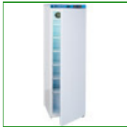
Labcold IntelliCold™ RLDF1510 - 430 Litre Pharmacy Fridge with Solid Door

All pharmacy fridges are developed with reliability and ease of use in mind. Our pharmacy refrigeration range conforms to the guidelines set out by the RPSGB and maintains an internal temperature of between +2°C and +8°C. We have added a number of improvements to certain popular models to ensure we are offering you the best possible secure and reliable refrigerated storage. Many of our fridges are available with different plug options for Europe and Australasia, or with compressors operating at 60Hz.