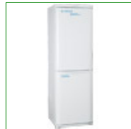
Labcold RLFF13246/LK Laboratory Fridge/Freezer 230/160 Litres

Capacity: 390 Litre 1965mm H x 595mm W x 630mm D Product Code: FPD-04937