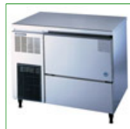
Hoshizaki Freestanding Flake/Nugget Ice Machine (110kg/24h)

Capacity: 110 kg/24h Config: Free Standing 800mm H x 940mm W x 600mm D