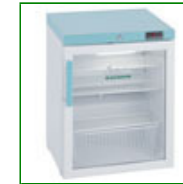
LEC PG207C - Pharmacy Fridge 82 Litre with Glass Door

Capacity: 82 Litre Config: Bench Top 660mm H x 502mm W x 540mm D Product Code: FPD-09744