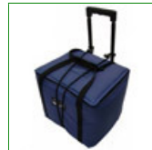
30 Litre Thermal Carry Bag with Trolley and 3 Separators